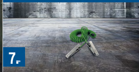
Static electricity and grounding