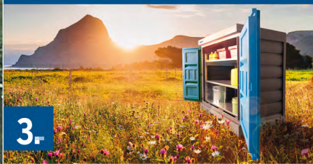
Hazardous Material Storage Containers