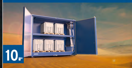
Heating systems for hazardous substances