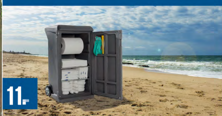
Absorbents and flood barriers