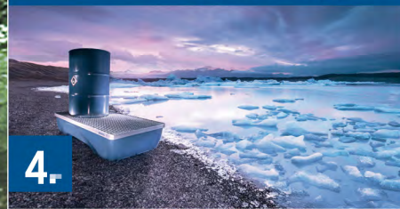
Spill trays and containment shelving & pallet racking systems