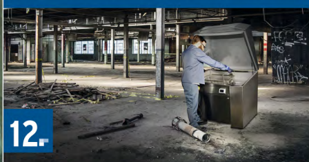
Industrial cleaning and disposal equipment